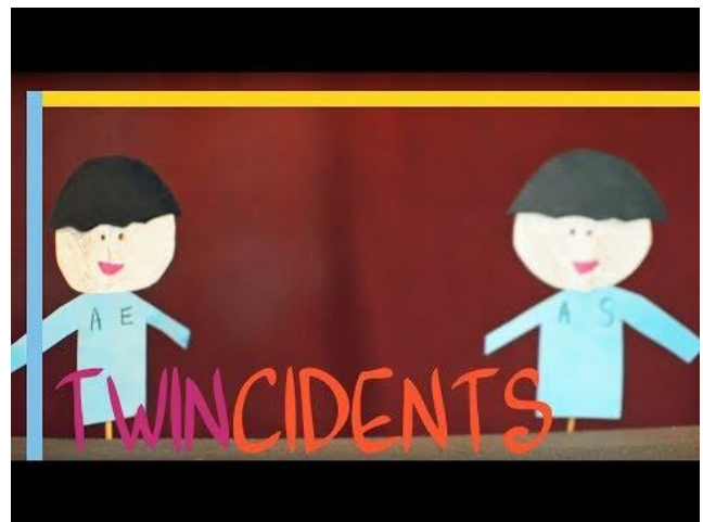
Video 4: Puppet Explanation of Play

These videos allow you as the viewer to understand the plot in a more comical way. You get the perspective of a student and a scene acted out, along with a funny adaptation of the puppet show. Both these videos explain the plot, but they add extra details and give some examples.