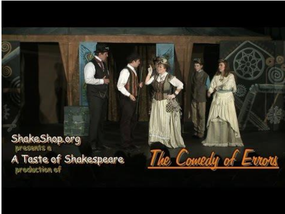
Video 5: A 2014 performance of The Comedy of Errors play by a Taste 'O Shakespeare's Steam-Punk