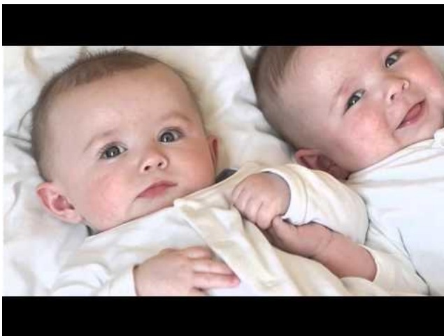
Video 3: Student Explanation of Play

The second video gives a little bit more of a description on the play and some extra details that the first video does not. The video also brings up some major themes that occur during the play and how the characters in the play react to these themes.