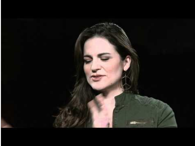
Video 1: Actor Portrayal of Play