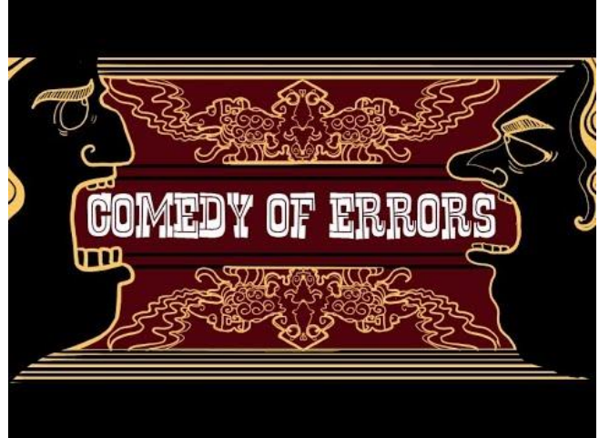
Video 2: Plot & Themes Explained

The videos above will help you understand the major plotline of The Comedy of Errors by William Shakespeare. They also discuss the characters and situations that occur within the play.